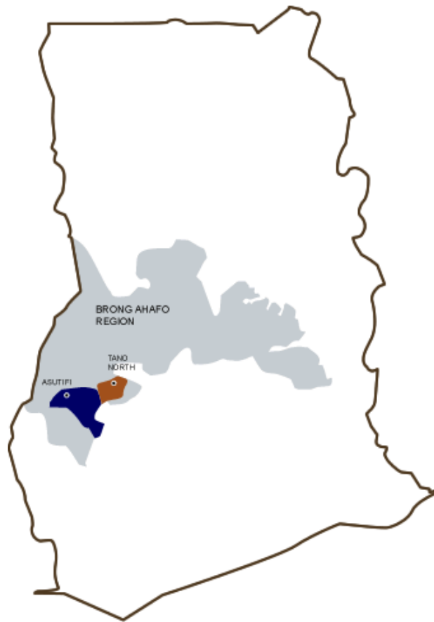
Figure 2-1 Map of Brong Ahafo Region Featuring Asutifi and Tano North Districts 54

The ten identified “host communities,” identified by NGGL because they overlap with the mining lease, are located in two districts inside the region: Asutifi North and Tano North (see Figure 2-1). The Ahafo South concession, within the Asutifi North district, contains the host communities of Ntotroso, Kenyasi No. 1, Kenyasi No. 2, Gyedu, and Wamahinso (see Figure 2-2). The host communities of Susuanso, Terchire, Yamfo, Afrisipakrom, and Adrobaa, are located in the Tano North district, within the Ahafo North concession (see Figure 2-2). 55 To date, NGGL has only carried out mining within the southern concession area; the northern communities have only experienced exploration activities. While there is no formally disclosed date for when the development of the Ahafo North mine will occur, in its first quarter 2018 results, Newmont noted that Ahafo North has advanced to a definitive feasibility study. 56