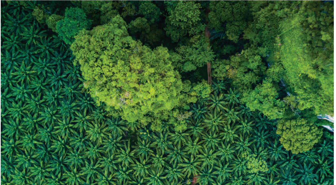
Oil palm plantation in Goa, India.