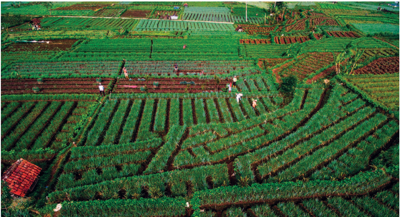
Farmers working in onion plantations in Argapura, Indonesia.

In summary, this paper highlights that the costs of investment treaties are increasingly apparent, but the benefits largely unproven; thus, it is an opportune time for countries to review their policies and practices regarding these instruments. The conclusion of this paper also suggests practical steps that states can take to assess these costs and benefits, and identifies considerations and strategies relevant for managing obligations contained in existing treaties and shaping future agreements.