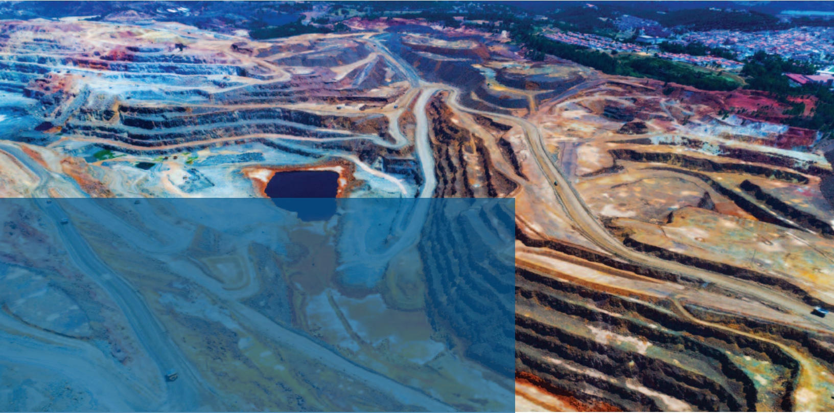
Open pit copper mine Atalaya, Rio Tinto, Spain.