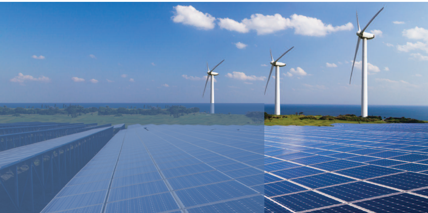
Solar and wind renewable energy in Okinawa, Japan.